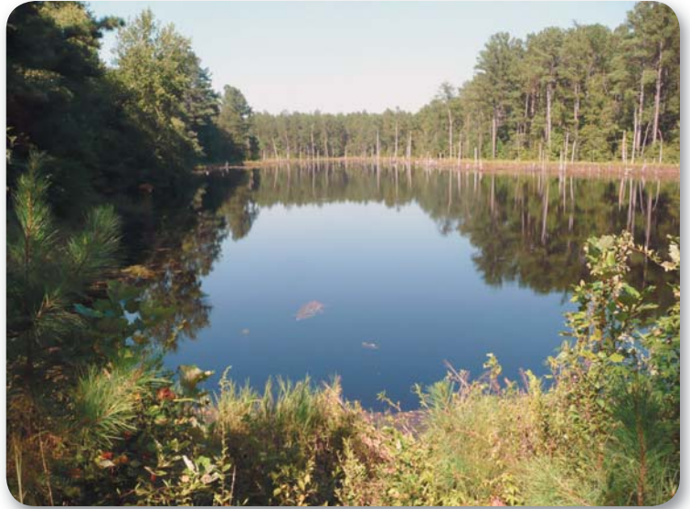
A ponds on the property

The Hogan farm conservation easement is a working lands easement whereby the intent of the protection effort is to keep the land in operation in perpetuity ensuring a revenue stream for the present landowner and future generations. The land is currently being farmed in high-quality coastal Bermuda hay production with a working forest