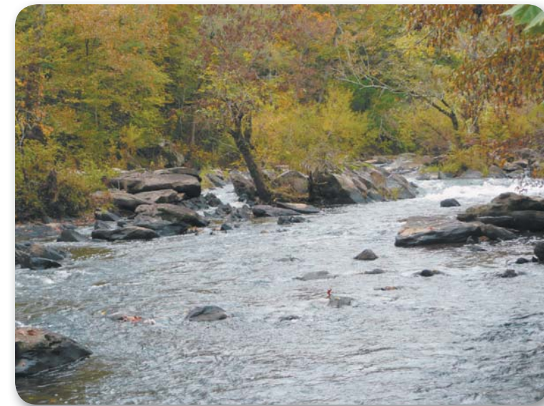
Deep River – Johnson’s Ford/Buzzard Rock complex

is the premier white water recreational site on the river making it a high priority protection area for the newly authorized unit of the North Carolina State Parks System – the Deep River State Trail.